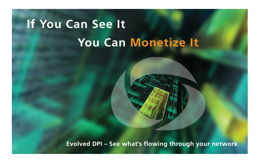
Source: Procera, http://www.proceranetworks.com/images/documents/procera_brochure_web_0620.pdf

Along these same lines, DPI firm Procera Networks markets a brochure titled, "If You Can See It, You Can Monetize It."<sup>47</sup> Procera recently boasted they had added 120 new customers in the second half of 2008.<sup>48</sup>