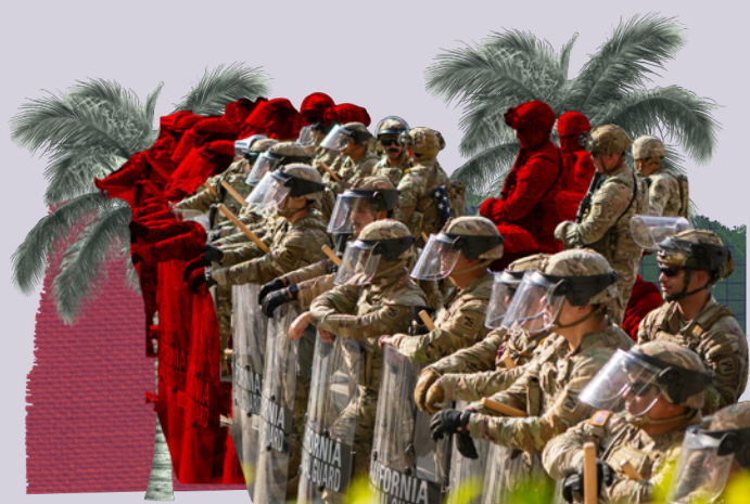
Militarized law enforcement and National Guard in Los Angeles.

Normalizing the police state has been one of the most visible hallmarks of the Trump administration, with online images showing law enforcement's militarized and brutal treatment of people — particularly protesters and the press. 108