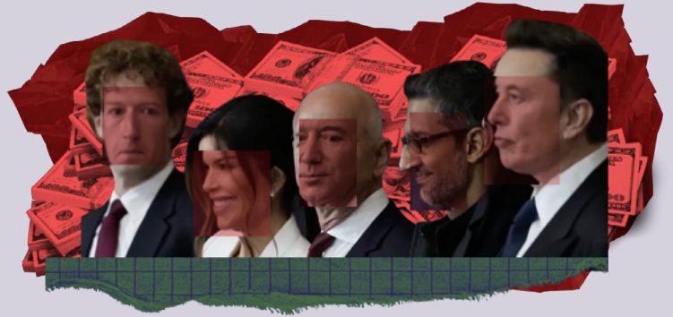
The front row of President Trump's inauguration, lined with media and tech billionaires who have capitulated and collaborated with the administration since day one to build their empires and curry favor with the president.

Many large media corporations have since caved to administration pressure to remove content or coverage Trump dislikes, or which paints him in a negative light. 95 Demonstrations of tech corporations' fealty to Trump have included million-dollar payments to bankroll the president's inauguration ceremonies, funds for his new White House ballroom and his future presidential library, and dubious legal settlements. 96