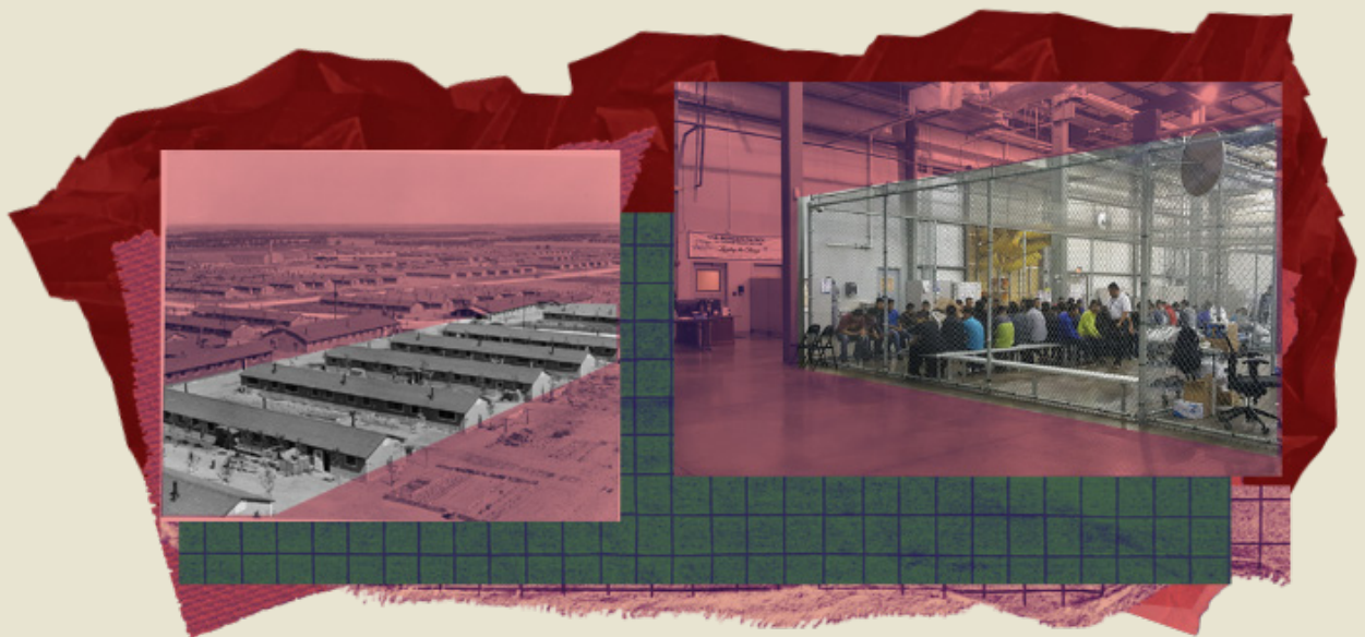
U.S. internment camps that housed Japanese Americans in the 1940s and a present-day detention center that houses Latinos and other immigrants.

The scapegoating of immigrants has always had the intended effect of pushing communities to castigate and dehumanize specific groups of people. As we reach this fever point of chaos and hate, it seems almost natural that President Trump would demonize immigrants to justify policies that persecute them.