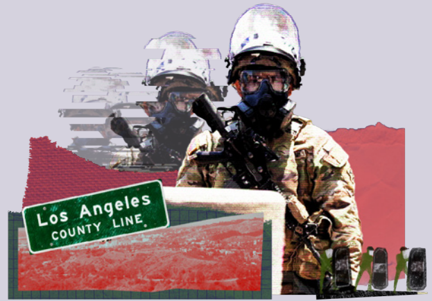
Militarized and masked agents deployed in Los Angeles in June.

Trump's response to organized protests has included sending the National Guard to numerous states that opposed these mobilizations. National Guardsmen have violated the First and Fourth Amendment rights of activists on the ground, assaulting and arresting people who had peaceably assembled. 53 Such treatment violates