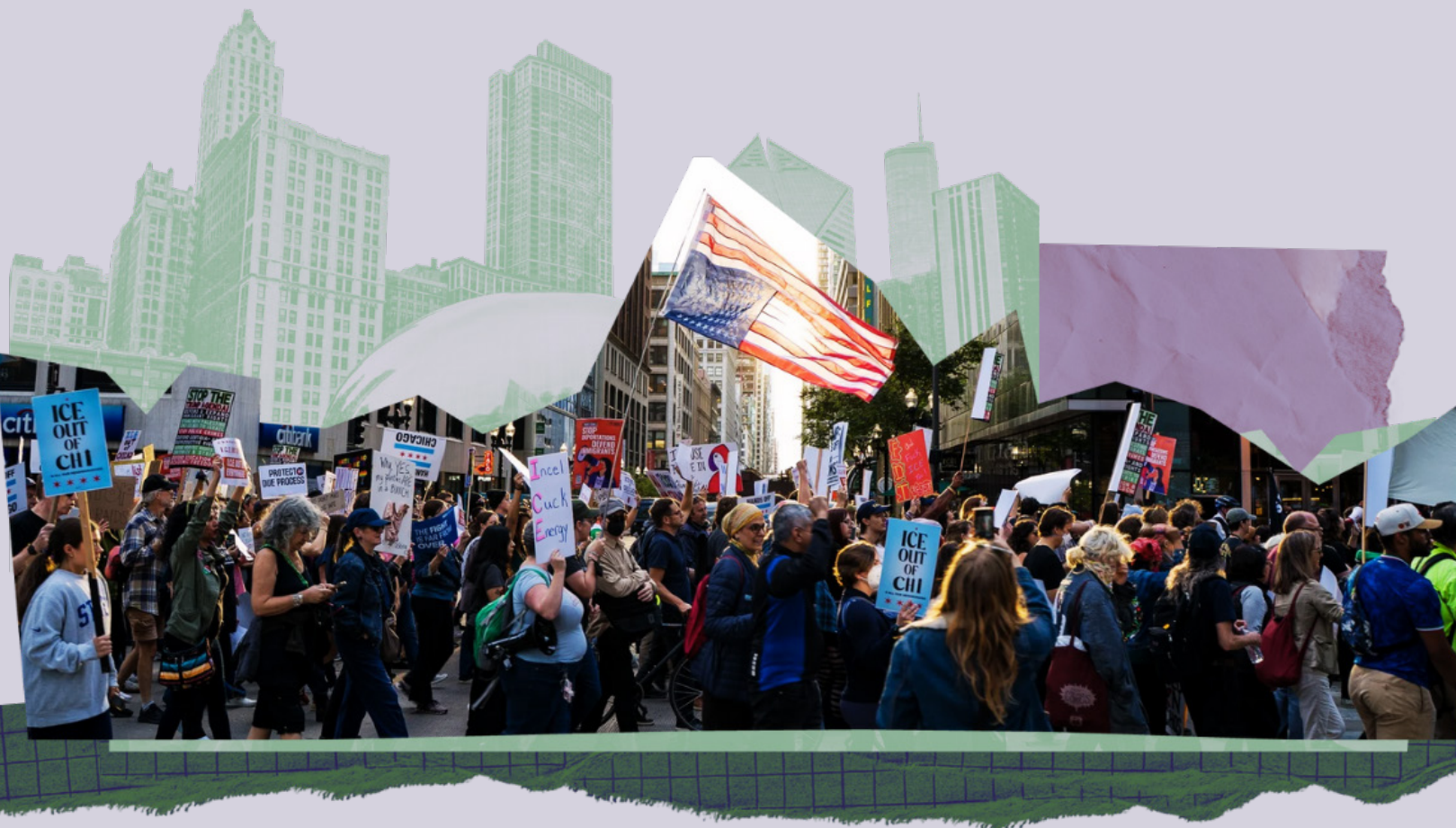
Chicago’s peaceful demonstrations, which the administration has recast as violent riots, prompted Trump to deploy National Guards to the city. This has led to a militarized crackdown on free speech and protest.

The constant attacks on people’s free-speech rights — and on targeted communities around the country — risk chilling the speech of the independent institutions that help protect us all. The goal is to remove viewpoints that counter Trump’s lies. 62