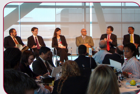
PBS' Ray Suarez moderated a roundtable that included two former FCC chairs.