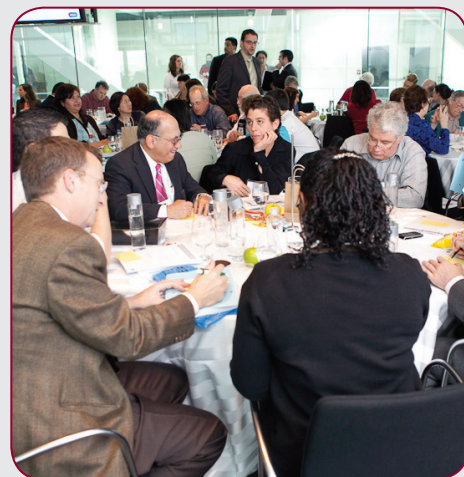
Small group discussions in the afternoon focused on the future of the Internet, journalism and public media.

National Economic Council followed the presentation.