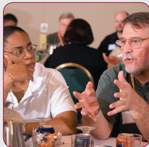
InternetforEveryone.org traveled to Durham, N.C., to talk with local residents about bridging the digital divide.