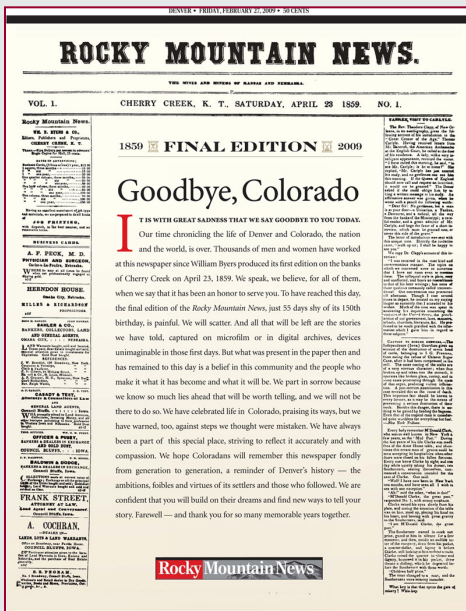
The final edition of the Rocky Mountain News , shown here, hit newsstands just a few months shy of the paper's 150th anniversary.